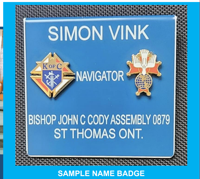
SAMPLE NAME BADGE

For These We Pray: [Please refer to the prayer intentions section of Communion]