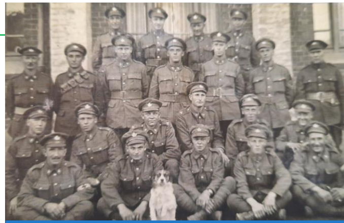
Members of the 75 th Battalion CEF (all Elgin boys)

As most of you know by now, I'm a military historian and often have folks show up at my doorstep with articles of clothing, badges, or medals for me to identify or to tell them where the items belong. A while back, a family from West Lorne brought me a WWI diary kept by a young man who ended up being their Great Grandfather. It is incredibly detailed and very insightful for such a young man that was experiencing the horrors of war so far from home for the very first time. I'd like to quote passages from his diary that hopefully, as Remembrance Day is upon us, give you pause to reflect upon during the traditional 2 minutes of silence we observe on that day.